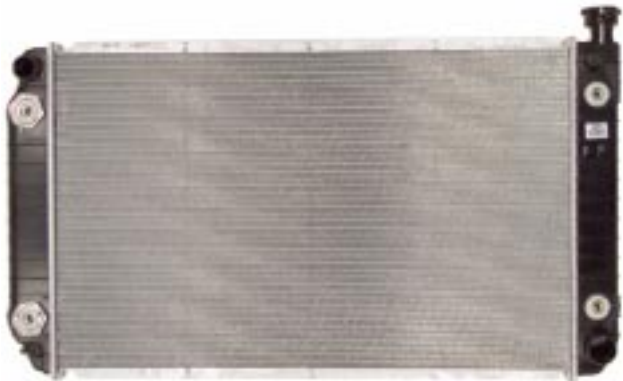
1988 -1991 5.7L Chevrolet C/K pickups

So, give your customers and yourself a break with a Performance Radiator 622-84!